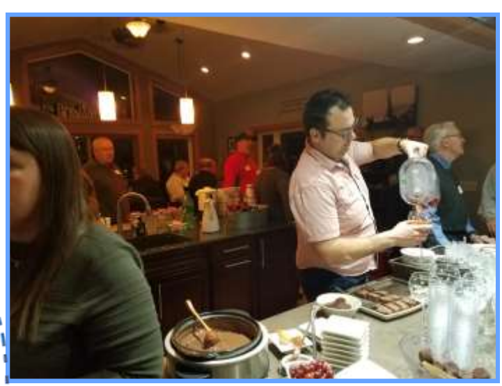
THANK YOU to all the host families!!